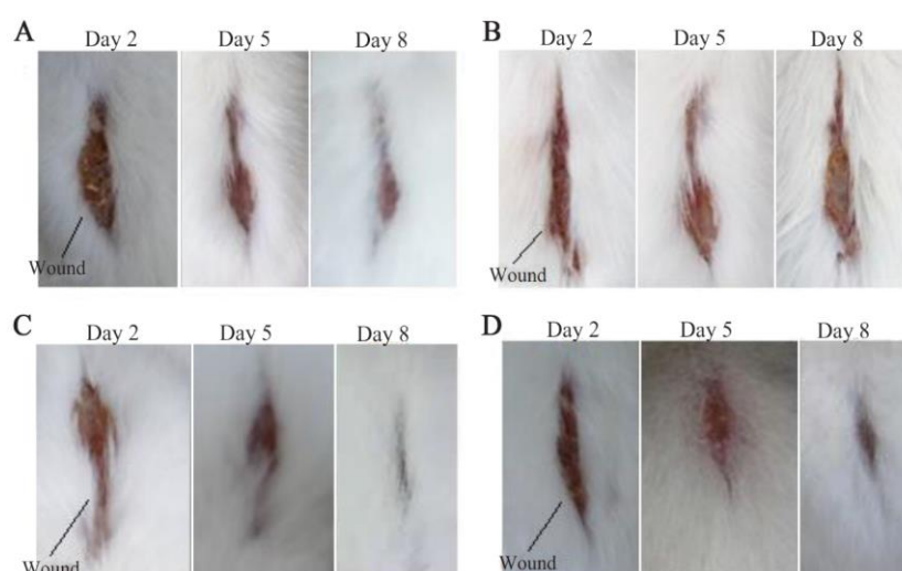
Figure 3. Wound condition of mice on days 2, 5, and 8 after being injured. Taking pictures using a camera with a resolution of 20 Megapixel. A) Wound condition of control mice that had blood glucose levels measured before treatment was 159 mg/dL and after treatment 172 mg/dL, where the wound area on day 8 was 0.32 cm 2 . B) Wound condition of control mice that had blood glucose levels measured before treatment was 177 mg/dL and after treatment 198 mg/dL, where the wound area on day 8 was 0.60 cm 2 . C) The condition of the mice's wounds that were given electrical stimulation and had blood glucose levels measured before treatment was 187 mg/dL and after treatment 177 mg/dL, where the wound area on day 8 was 0.04 cm 2 . D) The wound condition of mice that were given electrical stimulation and had glucose levels measured before treatment was 197 mg/dL and after treatment 172 mg/dL, where the wound area on day 8 was 0.10 cm 2 .

wound even though the injury is in an open condition without a wound dressing. Therefore, the effect of peeling the wound due to the opening of the dressing can be avoided. Economically, wound therapy with electrical stimulation is cheaper because the cost of procuring equipment is cheap, easy to obtain, and can be used repeatedly.