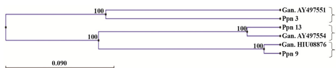
Figure 3. Strains with a coefficient of similarity value \geq 80\% were considered to belong to the same cluster. On the right, the strain code number and the different clusters (clusters 1 through 3) are reported.

philus influenzae with GenBank accession numbers (Gan), AY497551, HIU08876 and AY497554, respectively (Figure 3).