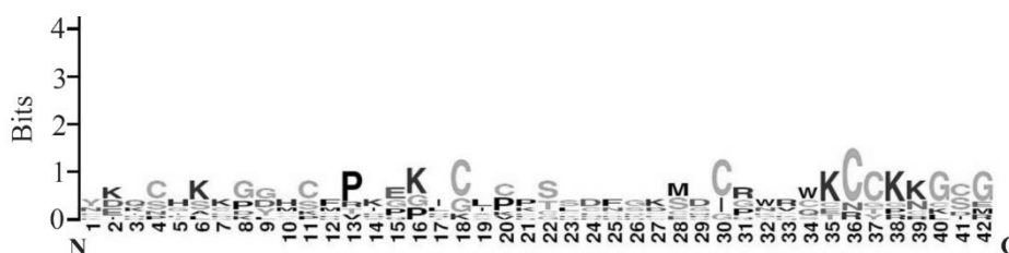
Figure 2. Amino acid composition in cell penetrating peptides.