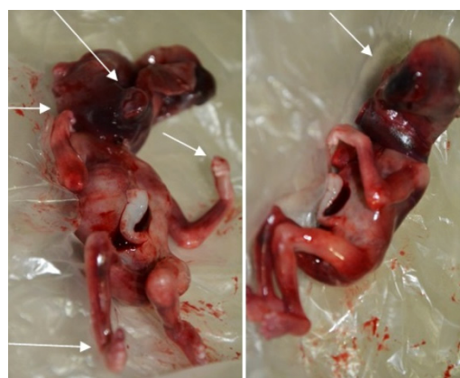
Figure 2. Images of triploid fetus. Arrows show the phenotypes highly associated with triploidy including hydrocephaly, low set ears, bilateral syndactyly of the third and fourth digits and club foot.

However, the majority of these triploid cases abort during the first trimester or even later as spontaneous abortions, so that ultimately it leads to the rarity of the triploidy in cases that underwent amniocentesis, approximately 1:3300 9 . Eventually, the incidence rate reaches the lowest in live-born, approximately 1:10,000 10 . Regardless of the lethality of the triploidy as a general rule, as shown in our case, some triploid pregnancies can continue until the later stages of pregnancy and impose great concern to the families. Routine first trimester screening strategy has the potential to detect a much broader range of chromosomal aberrations, including triploidy, small supernumerary marker chromosomes and rare numerical and/or structural chromosomal abnormalities in addition to common aneuploidies ( i.e. 13, 18 and 21). Given a triploid pregnancy, regardless of the NT value, double marker MoM to a large degree shows a characteristic pattern. In that, in diandric triploidy, a combination of increased free BHCG MoM and moderately decreased PAPP-A MoM can be seen. On the other hand, in cases of digynic triploidy, double markers demonstrate markedly decreased free BHCG and PAPP-A MoMs 2,8 . In our report, the potential of this biochemical combination was emphasized to predict and/or confirm a triploid pregnancy in earlier stages of pregnancy or in confronting with a triploid karyotype result after amniocentesis.